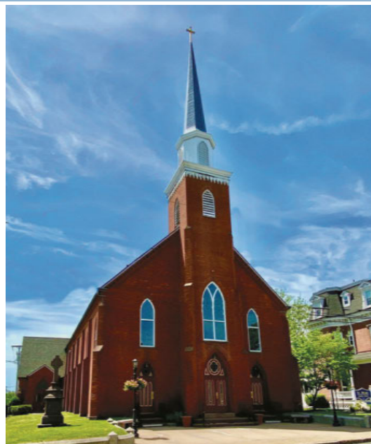
ST. MARY CHURCH 42 Spring Street, Windsor Locks, CT EST. 1852