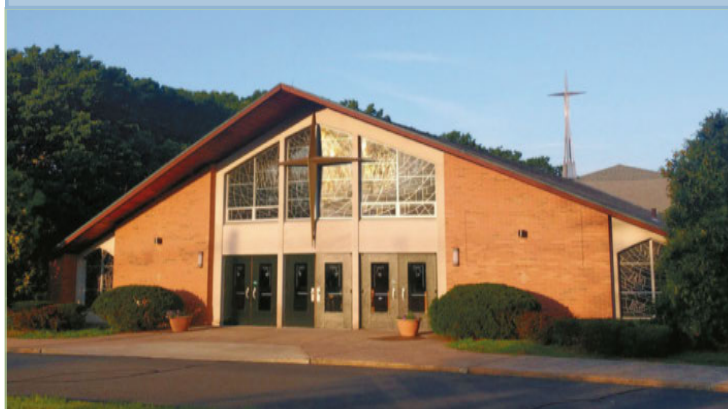
ST. ROBERT BELLARMINA CHURCH 52 South Elm Street, Windsor Locks, CT EST. 1960